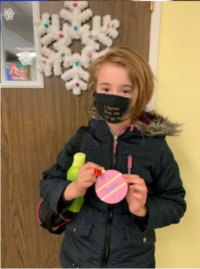
Loving our personalized ornaments! ♥