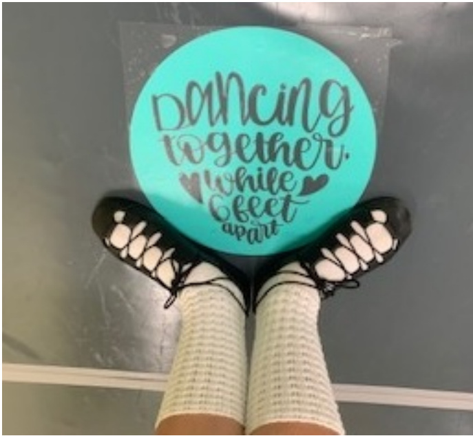
Touch your Toes ... Not your Nose!