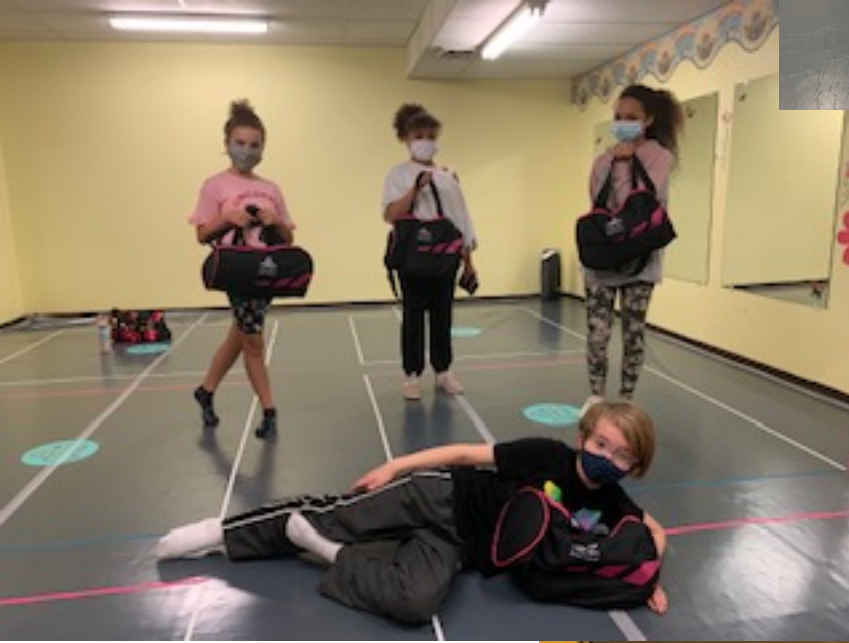
Rocking some new swag - always got a place to store our dance stuff!