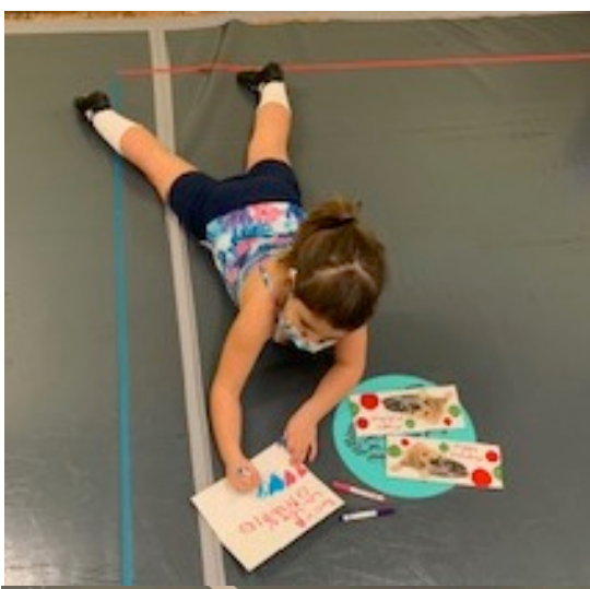
Making Cards for the residents of William Booth Care Home