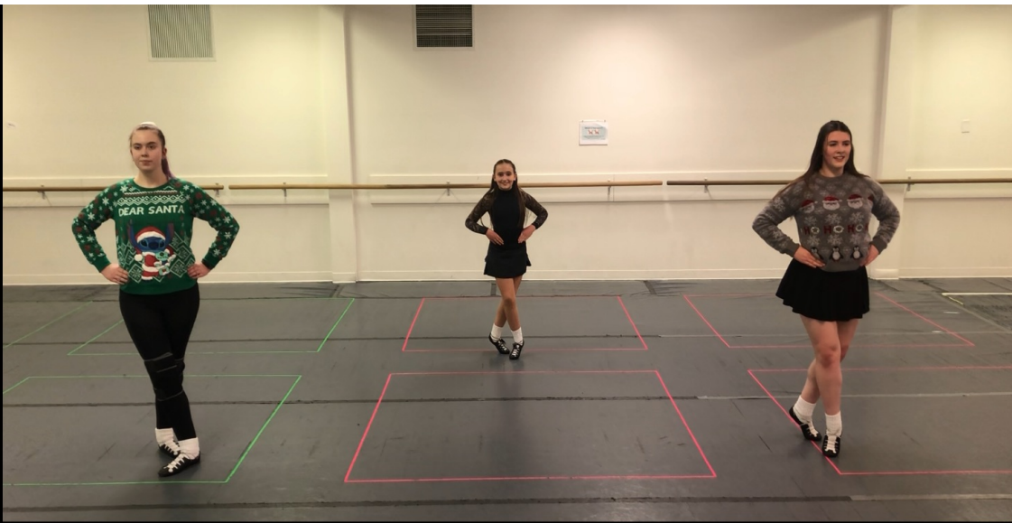
Recording our Hope for the Holiday's Choreography!