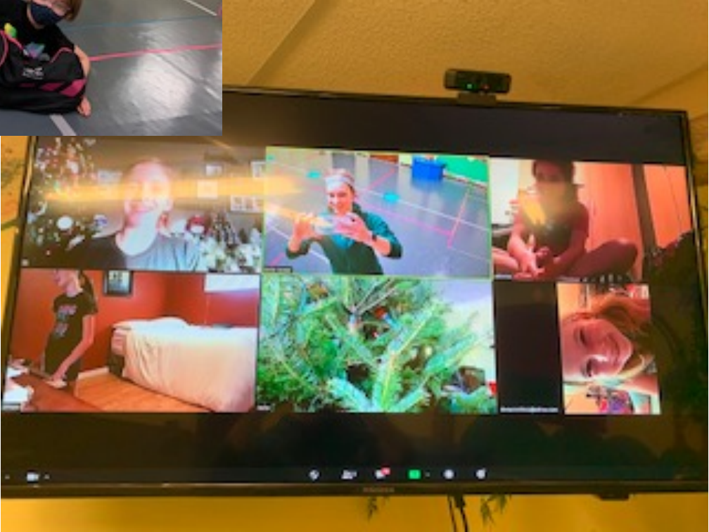
Check out the famous ladies dancing on TV!