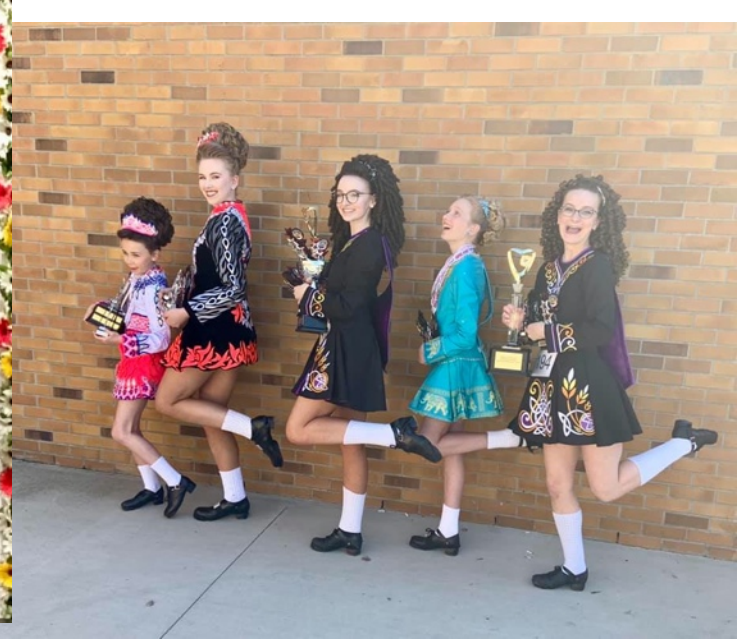
Showing off our Trophies