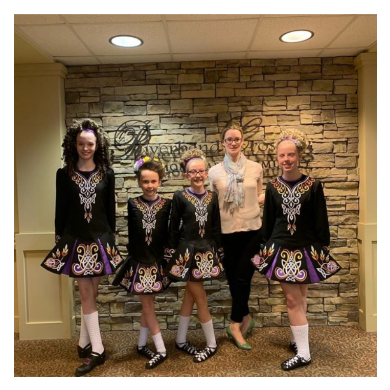
Performing for the Residents at Riverbend Crossing