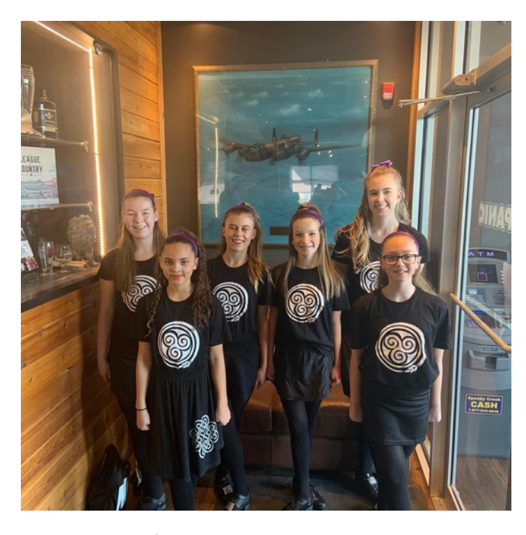
St. Paddy's stop at Lancaster Taphouse