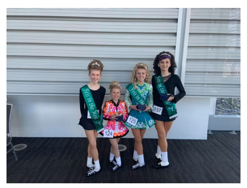
Feis in the West