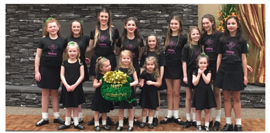
St Patrick's Day 2019