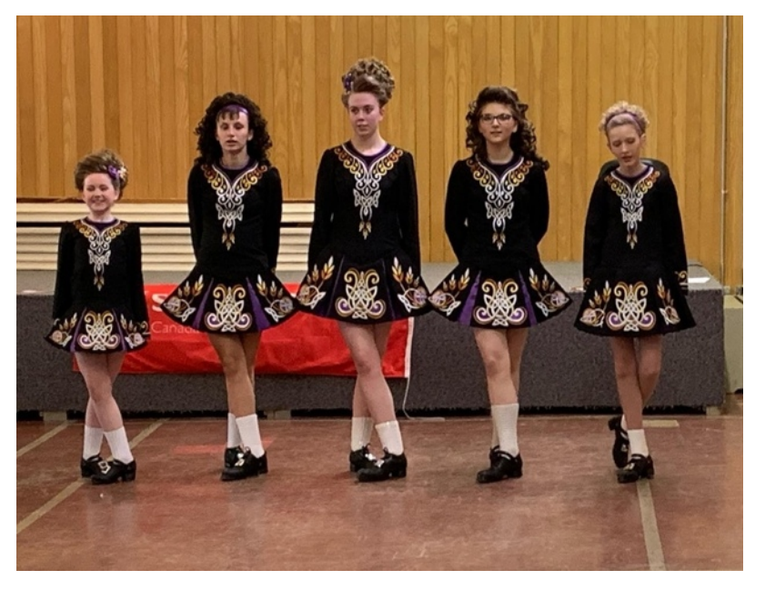
Strawberry Social - a favourite Annual Performance