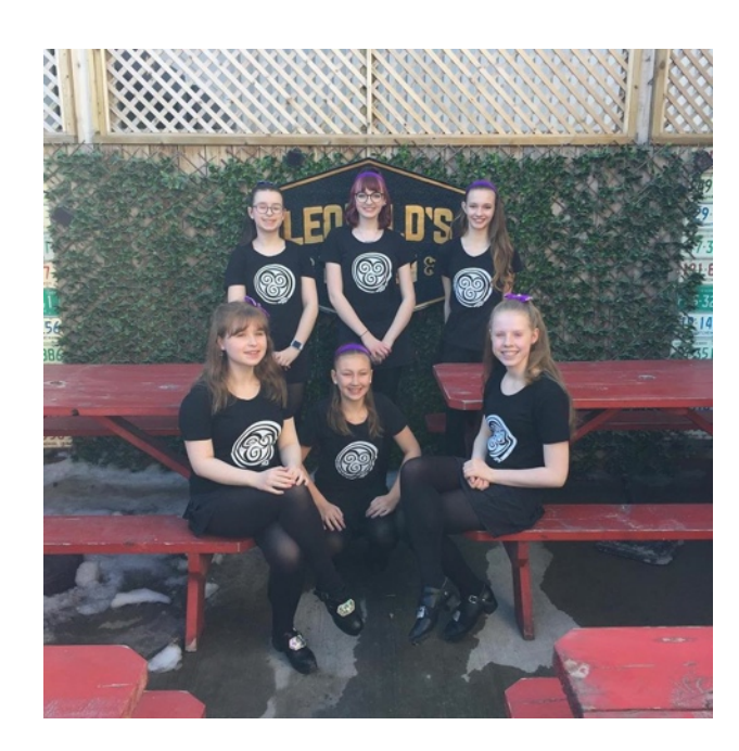
St. Paddy's stop at Leopold's Tavern