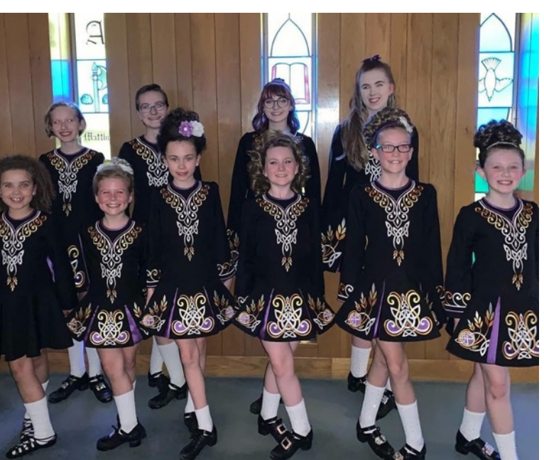
Lakeview United Church St. Patrick's Day Dinner