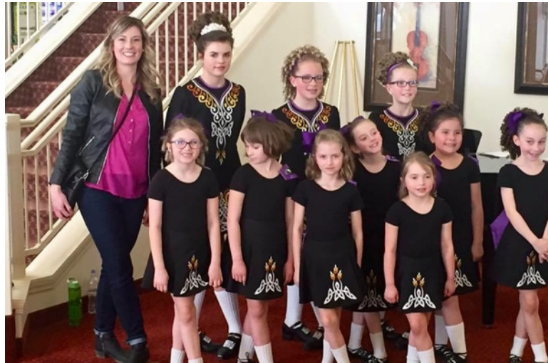
Victoria Park Personal Care Home