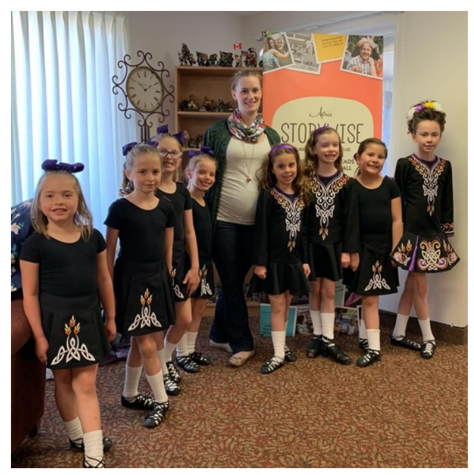
Dancing at Mulberry Estates in Moose Jaw