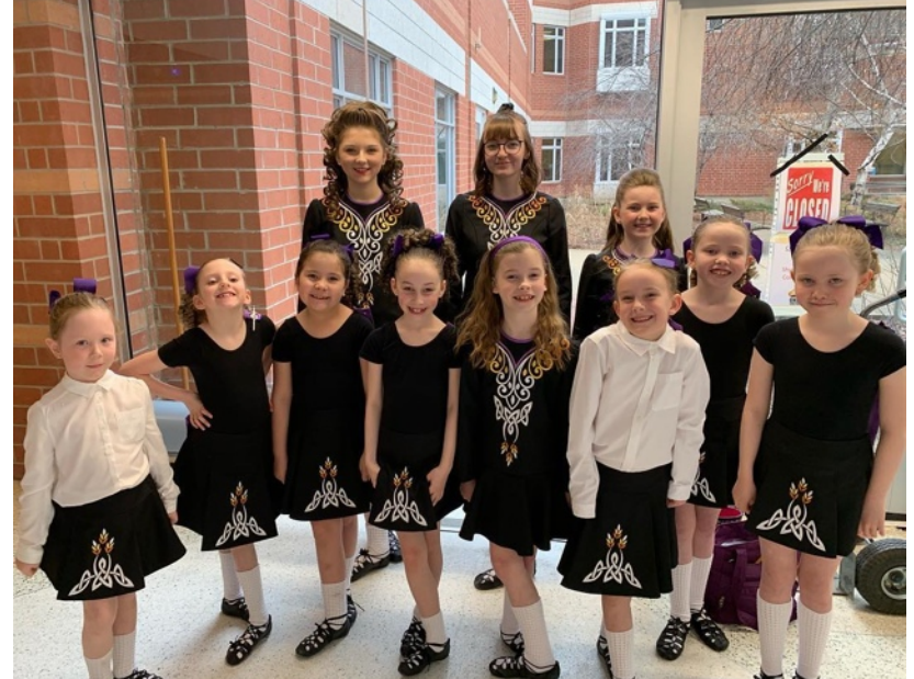
Wascana Rehab Centre performance